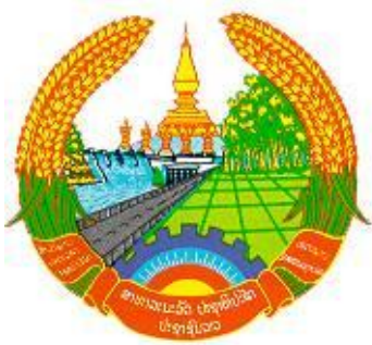
Government of Lao PDR